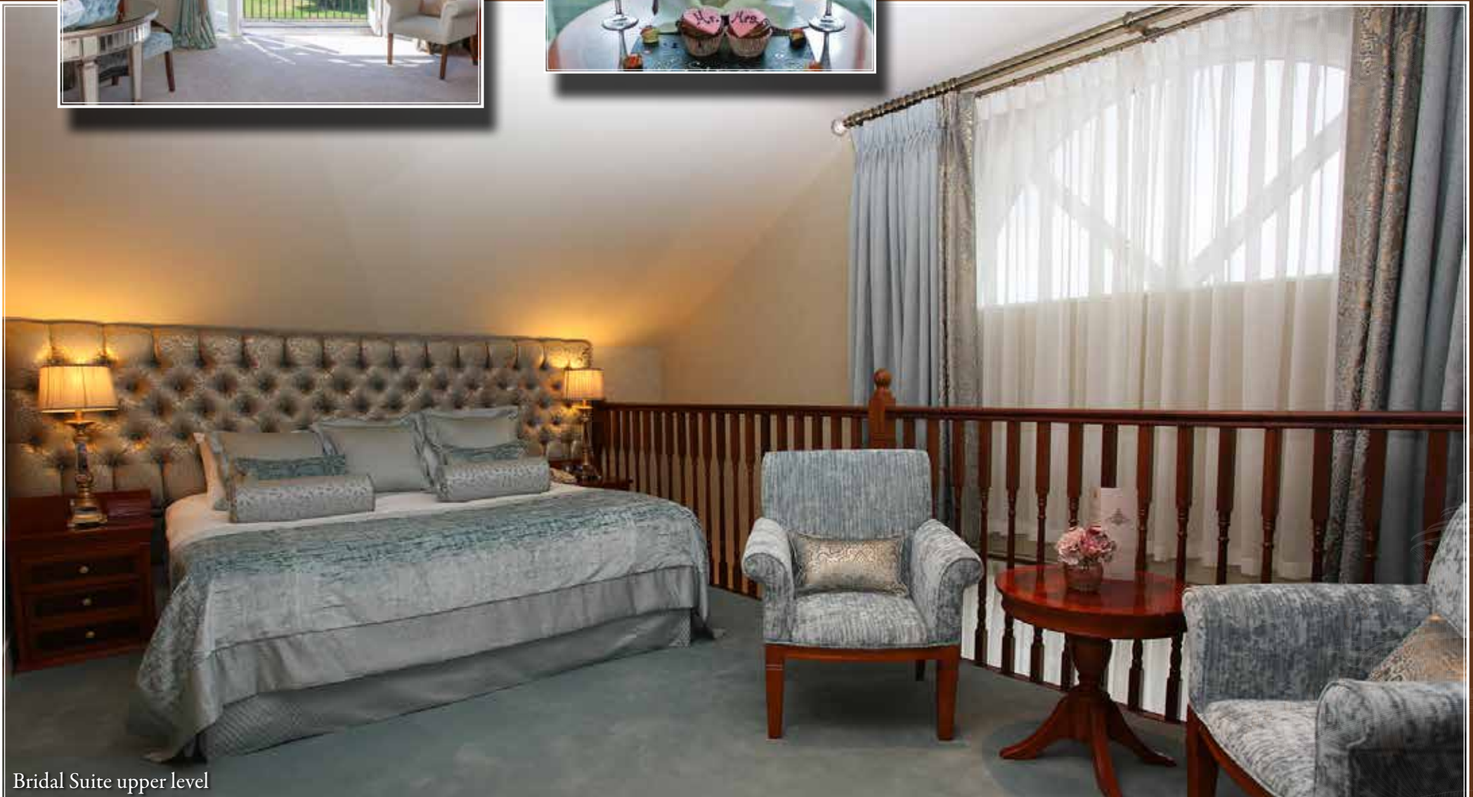
Bridal Suite upper level

The Knightsbrook Hotel, Spa & Golf Resort features 131 luxury bedrooms and suites which are warm and relaxing with many offering stunning views over our renowned championship golf course. Our bridal suite is yours for two days with our famous 'Mr & Mrs' cupcakes there to welcome you. Over two levels, the suite offers the ultimate in comfort and elegance. Alternatively, your guests may choose to stay in one of our exclusive courtyard homes set in a picturesque setting adjacent to the hotel. Each house has three en-suite luxury rooms and are available on a self-catering basis.